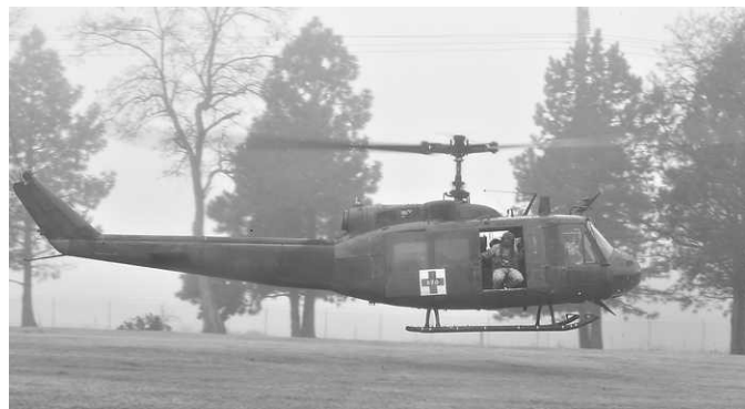
UH-1 makes final flight before retirement, January 26, 2011.

The Huey was well known in its role as a medevac chopper and its pilots earned a reputation as the "cowboys of aviation" for their willingness to fly whenever,